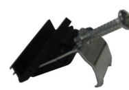
1 x AX1032 Composite inset fixing clips x 6