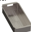
1 x AX1508 System Colander