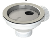
1 x AX1002 (m) 90mm (1.5") Orbit manual basket strainer waste - long bolt