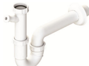
1 x AX1008 (m) 1.0 Bowl pipework