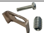
1 x AX1153 M 6 x Undermount clip, 6 x 17mm long x Ø10.64 soft thread tapex & 6 x 30mm domehead screw