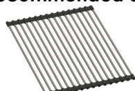
1 x AX2506 System Drainer / Trivet (roll up)