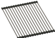
1 x AX2506 System Drainer / Trivet (roll up)