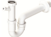
1 x AX1008 (m) 1.0 Bowl pipework