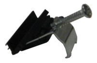
1 x AX1032 Composite inset fixing clips x 6