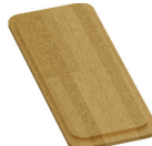
1 x AX2024 System Bamboo Chopping Board

All accessories can be purchased directly from www.abode-shop.co.uk or phone 01226 283434