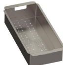
1 x AX1508 System Colander