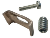
1 x AX1153 M 6 x Undermount clip, 6 x 17mm long x Ø10.64 soft thread tapex & 6 x 30mm domehead screw